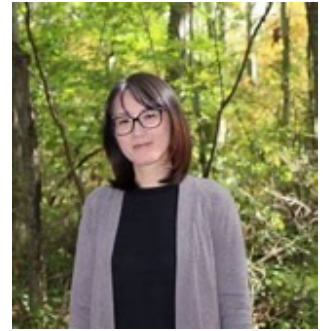
Satomi Quilts - Modern Quilt Patterns